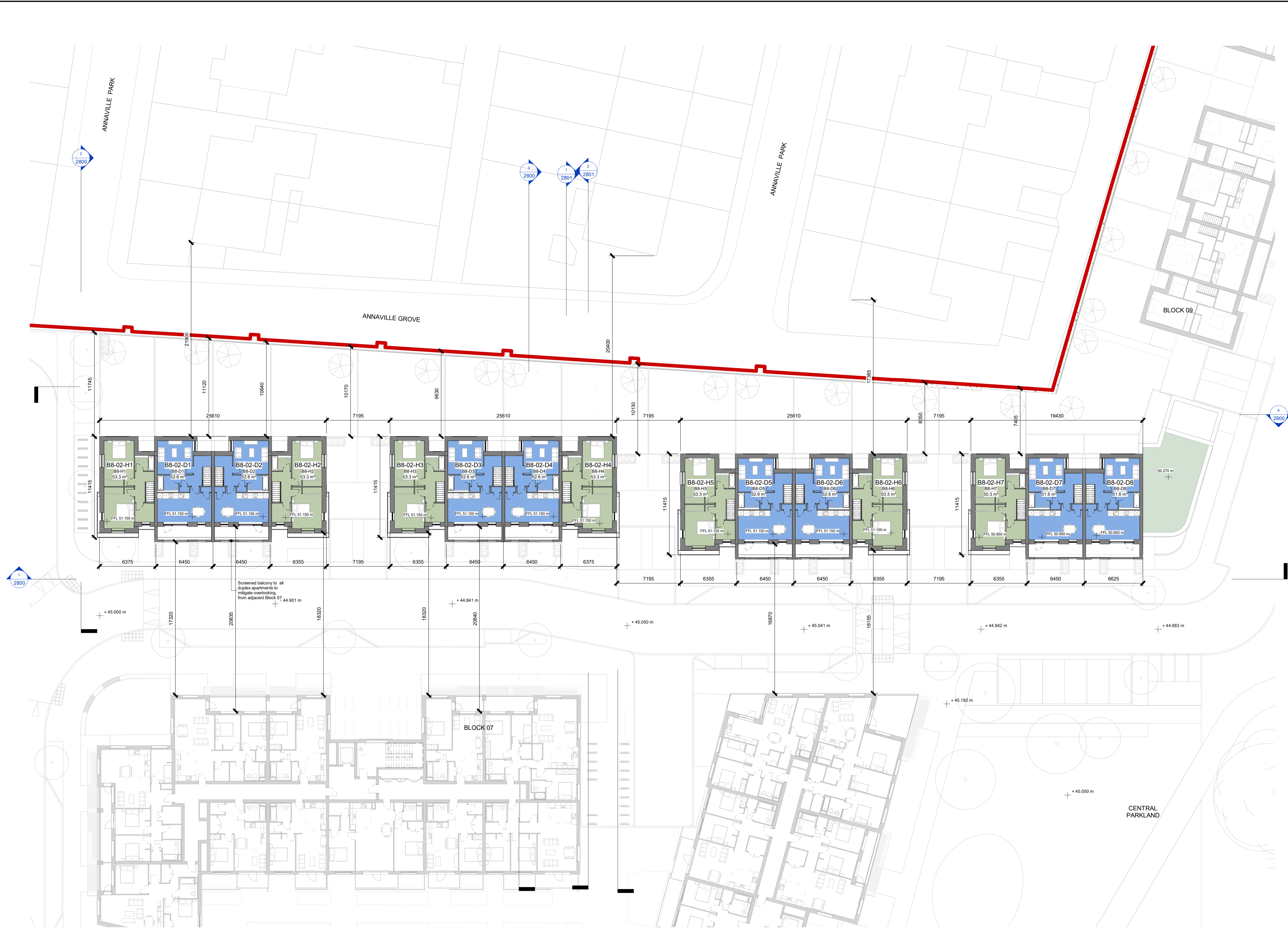
B8_02 - Second Floor Plan 1 : 200

Notes: - Do not scale from this drawing. Use figured dimensions in all cases. - Verify dimensions on site and report any discrepancies to the Architect immediately. - This drawing is to be read in conjunction with the Architect's Specification. - © This drawing is copyright and may only be reproduced with the Architect's permission.